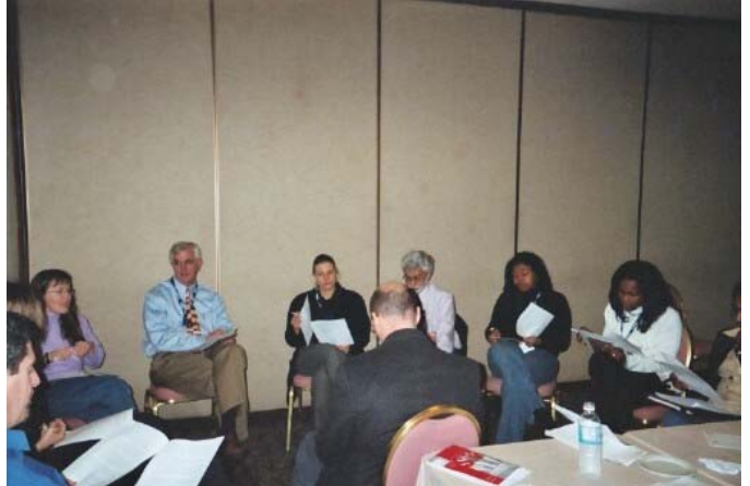
Additional breakout session