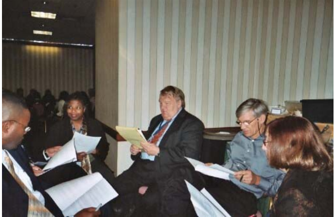
CLEA Members at work in breakout sessions during CLEA's General Membership Meeting